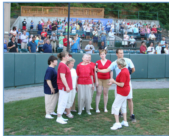
The Wilderness Road Chorus sang the National Anthem before a Pulaski Mariners baseball game.